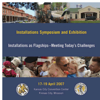
Artwork courtesy of AUSA

AUSA Army Installations Symposium & Exhibition Installations as Flagships--Meeting Today's Challenges