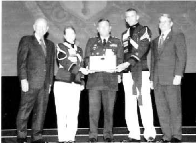
VA Tech Corps Distinguished Service Award