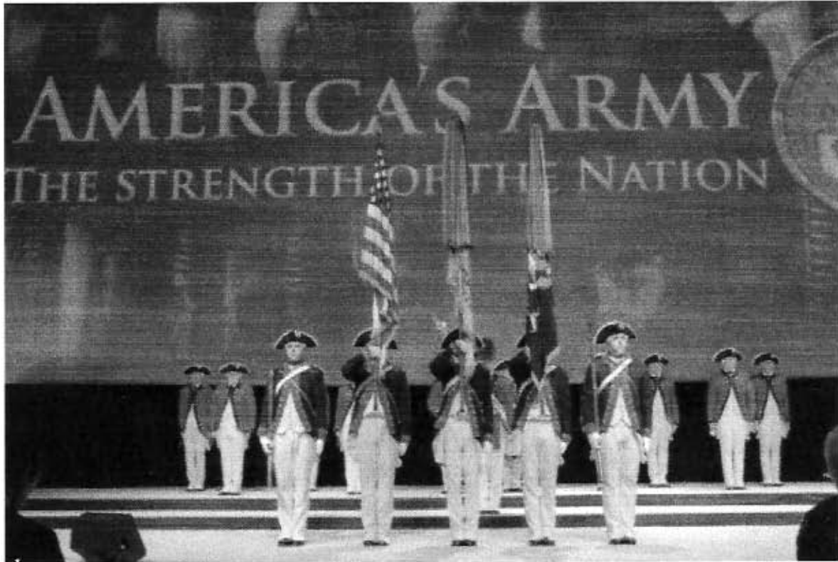
POSTING OF THE COLORS ON OPENING DAY AT THE 2007 AUSA ANNUAL MEETING